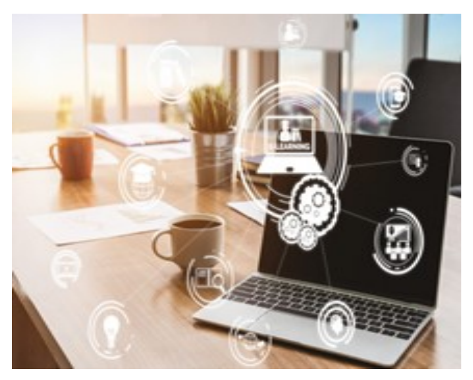
The Library on your Desktop